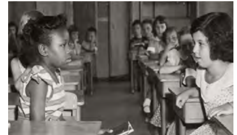
Federal court decisions ended the practice of having segregated schools for Mexican-American and African-American students.

Congress applied the Equal Protection Clause to education by enacting laws governing state school programs or activities: